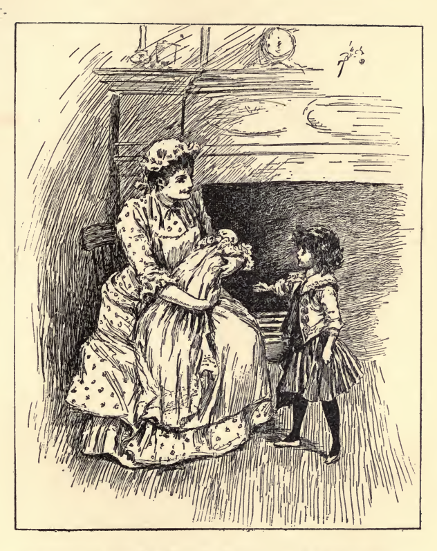
FAUNTLEROY'S WELCOME INTO THE WORLD: "F'OW HIM IN 'ER FIRE!"